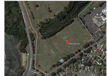
CLUB LOCATION: KELSO PARK PANANIA NSW 2213

Our club welcomes players of all ages genders and abilities. Whether you are on the path to Premier League or looking to have a kick with friends you are Welcome at Panania Diggers